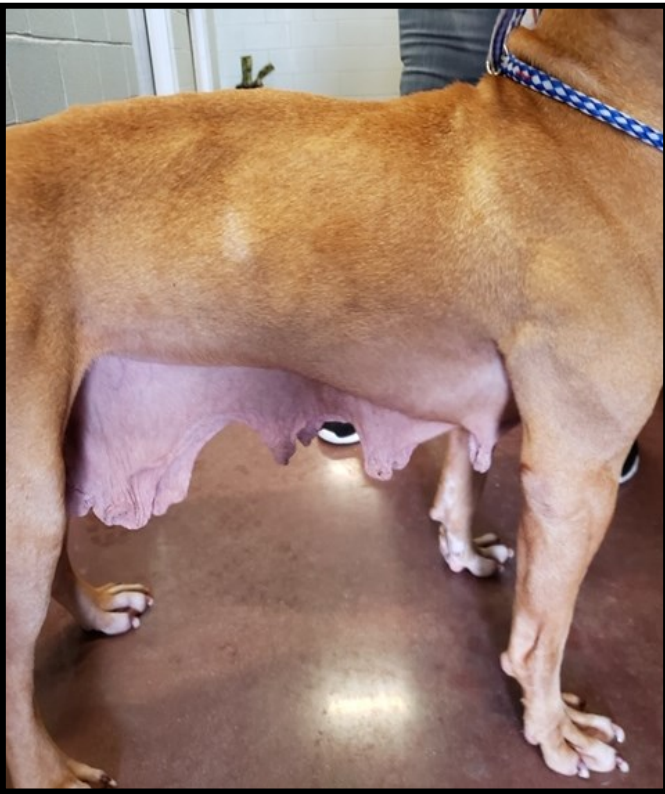
Above: Flora before her excess skin removal surgery at the vet's office.

If you've been receiving the newsletter for some time you are probably very familiar with the Mend-A-Paw fund and just how many dogs it has helped over the last twenty years. For those new to reading the newsletter, the Mend-A-Paw fund is arguably our most important fundraising initiative. It is comprised of money specifically raised to put towards injured or ill dogs that enter the shelter whose medical costs will exceed the Town's budget. In 2018 alone, over $32,000 dollars was spent to cover procedures like dental cleanings/ extractions and cherry eye corrections, as well as things like special veterinary foods, heartworm tests, and medications. Thanks to the fund, all of the Mend-A-Paw recipients from 2018 are now in forever, loving homes.