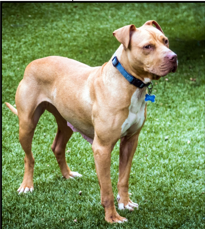
Below : Flora poses to show off her new bod.

After a few consultations it was determined that Flora would safely have most of the excess tissue removed surgically— a “tummy tuck,” if you will. Everything went swimmingly and she has spent the past few weeks in recovery. The stitches are now healed and Flora does not need any follow up care as result of the surgery— she is now actively seeking the “paw-fect” family to adopt her!